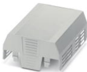
Component housing, without connection opening, Upper part, color: gray, width: 90 mm

Please be informed that the data shown in this PDF Document is generated from our Online Catalog. Please find the complete data in the user's documentation. Our General Terms of Use for Downloads are valid ( http://phoenixcontact.com/download )