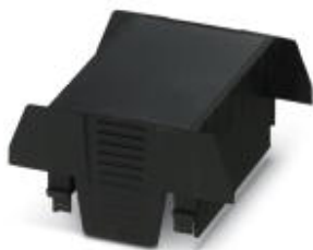
Component housing, connection opening on both sides, Upper part, color: black, width: 67.5 mm

Please be informed that the data shown in this PDF Document is generated from our Online Catalog. Please find the complete data in the user's documentation. Our General Terms of Use for Downloads are valid ( http://phoenixcontact.com/download )