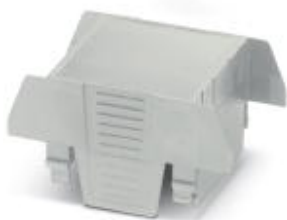
Component housing, connection opening on both sides, Upper part, color: gray, width: 45 mm

Please be informed that the data shown in this PDF Document is generated from our Online Catalog. Please find the complete data in the user's documentation. Our General Terms of Use for Downloads are valid ( http://phoenixcontact.com/download )