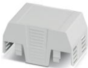
Component housing, without connection opening, Upper part, color: gray, width: 45 mm

Please be informed that the data shown in this PDF Document is generated from our Online Catalog. Please find the complete data in the user's documentation. Our General Terms of Use for Downloads are valid ( http://phoenixcontact.com/download )