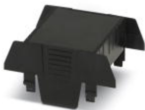
Component housing, connection opening on both sides, Upper part, color: black, width: 52.5 mm

Please be informed that the data shown in this PDF Document is generated from our Online Catalog. Please find the complete data in the user's documentation. Our General Terms of Use for Downloads are valid ( http://phoenixcontact.com/download )