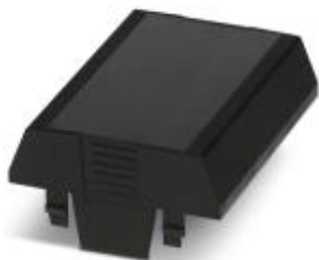
Component housing, without connection opening, Upper part, color: black, width: 90 mm

Please be informed that the data shown in this PDF Document is generated from our Online Catalog. Please find the complete data in the user's documentation. Our General Terms of Use for Downloads are valid ( http://phoenixcontact.com/download )