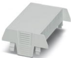
Component housing, connection opening on one side, Upper part, color: gray, width: 90 mm

Please be informed that the data shown in this PDF Document is generated from our Online Catalog. Please find the complete data in the user's documentation. Our General Terms of Use for Downloads are valid ( http://phoenixcontact.com/download )