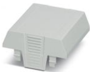
Component housing, without connection opening, Upper part, color: gray, width: 67.5 mm

Please be informed that the data shown in this PDF Document is generated from our Online Catalog. Please find the complete data in the user's documentation. Our General Terms of Use for Downloads are valid ( http://phoenixcontact.com/download )