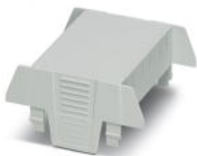
Component housing, connection opening on both sides, Upper part, color: gray, width: 67.5 mm

Please be informed that the data shown in this PDF Document is generated from our Online Catalog. Please find the complete data in the user's documentation. Our General Terms of Use for Downloads are valid ( http://phoenixcontact.com/download )