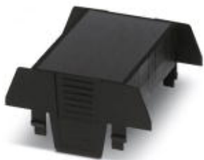
Component housing, connection opening on both sides, Upper part, color: black, width: 67.5 mm

Please be informed that the data shown in this PDF Document is generated from our Online Catalog. Please find the complete data in the user's documentation. Our General Terms of Use for Downloads are valid ( http://phoenixcontact.com/download )