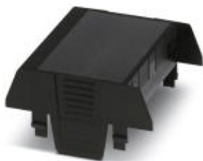
Component housing, connection opening on one side, Upper part, color: black, width: 67.5 mm

Please be informed that the data shown in this PDF Document is generated from our Online Catalog. Please find the complete data in the user's documentation. Our General Terms of Use for Downloads are valid ( http://phoenixcontact.com/download )