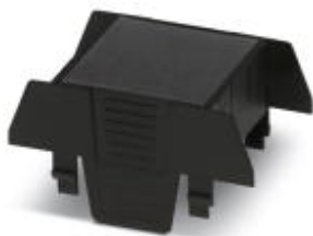
Component housing, connection opening on both sides, Upper part, color: black, width: 45 mm

Please be informed that the data shown in this PDF Document is generated from our Online Catalog. Please find the complete data in the user's documentation. Our General Terms of Use for Downloads are valid ( http://phoenixcontact.com/download )