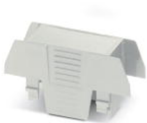
Component housing, connection opening on both sides, Upper part, color: gray, width: 22.5 mm

Please be informed that the data shown in this PDF Document is generated from our Online Catalog. Please find the complete data in the user's documentation. Our General Terms of Use for Downloads are valid ( http://phoenixcontact.com/download )