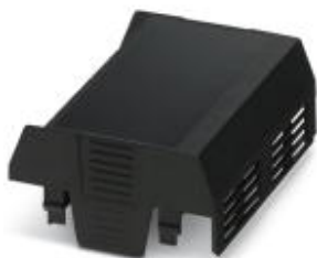
Component housing, connection opening on one side, Upper part, color: black, width: 90 mm

Please be informed that the data shown in this PDF Document is generated from our Online Catalog. Please find the complete data in the user's documentation. Our General Terms of Use for Downloads are valid ( http://phoenixcontact.com/download )