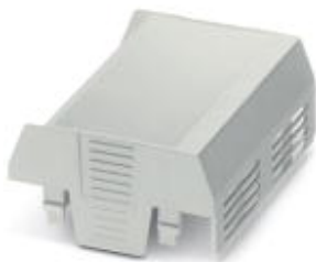
Component housing, connection opening on one side, Upper part, color: gray, width: 90 mm

Please be informed that the data shown in this PDF Document is generated from our Online Catalog. Please find the complete data in the user's documentation. Our General Terms of Use for Downloads are valid ( http://phoenixcontact.com/download )