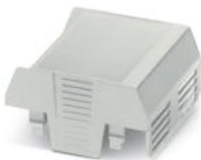
Component housing, connection opening on one side, Upper part, color: gray, width: 67.5 mm

Please be informed that the data shown in this PDF Document is generated from our Online Catalog. Please find the complete data in the user's documentation. Our General Terms of Use for Downloads are valid ( http://phoenixcontact.com/download )