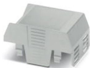
Component housing, connection opening on one side, Upper part, color: gray, width: 45 mm

Please be informed that the data shown in this PDF Document is generated from our Online Catalog. Please find the complete data in the user's documentation. Our General Terms of Use for Downloads are valid ( http://phoenixcontact.com/download )