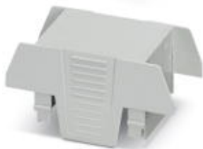
Component housing, connection opening on both sides, Upper part, color: gray, width: 35 mm

Please be informed that the data shown in this PDF Document is generated from our Online Catalog. Please find the complete data in the user's documentation. Our General Terms of Use for Downloads are valid ( http://phoenixcontact.com/download )