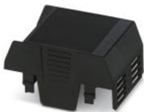
Component housing, connection opening on one side, Upper part, color: black, width: 52.5 mm

Please be informed that the data shown in this PDF Document is generated from our Online Catalog. Please find the complete data in the user's documentation. Our General Terms of Use for Downloads are valid ( http://phoenixcontact.com/download )