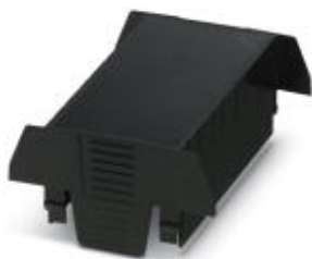
Component housing, connection opening on both sides, Upper part, color: black, width: 90 mm

Please be informed that the data shown in this PDF Document is generated from our Online Catalog. Please find the complete data in the user's documentation. Our General Terms of Use for Downloads are valid ( http://phoenixcontact.com/download )