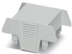
Component housing, connection opening on both sides, Upper part, color: gray, width: 45 mm

Please be informed that the data shown in this PDF Document is generated from our Online Catalog. Please find the complete data in the user's documentation. Our General Terms of Use for Downloads are valid ( http://phoenixcontact.com/download )