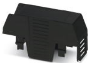
Component housing, connection opening on one side, Upper part, color: black, width: 22.5 mm

Please be informed that the data shown in this PDF Document is generated from our Online Catalog. Please find the complete data in the user's documentation. Our General Terms of Use for Downloads are valid ( http://phoenixcontact.com/download )