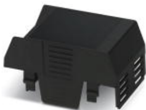
Component housing, connection opening on one side, Upper part, color: black, width: 45 mm

Please be informed that the data shown in this PDF Document is generated from our Online Catalog. Please find the complete data in the user's documentation. Our General Terms of Use for Downloads are valid ( http://phoenixcontact.com/download )