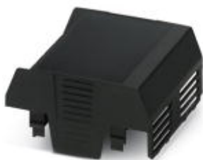
Component housing, connection opening on one side, Upper part, color: black, width: 67.5 mm

Please be informed that the data shown in this PDF Document is generated from our Online Catalog. Please find the complete data in the user's documentation. Our General Terms of Use for Downloads are valid ( http://phoenixcontact.com/download )