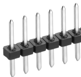
PCB connectors>Male headers □ 0.5 mm, straight