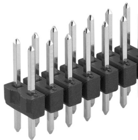
PCB connectors>Male headers two rows, \square 0.635 mm