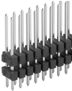
PCB connectors>Male headers □ 0.635 mm, Sandwich