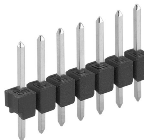
PCB connectors>Male headers one row, \square 0.635 mm