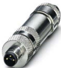
Connector, 3-position, shielded, Plug straight M8, A-coded, Screw connection, Knurl material: Nickel-plated brass, External cable diameter 3.5 mm ... 5.5 mm

Please be informed that the data shown in this PDF Document is generated from our Online Catalog. Please find the complete data in the user's documentation. Our General Terms of Use for Downloads are valid ( http://phoenixcontact.com/download )