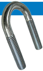
DIN 3570 A